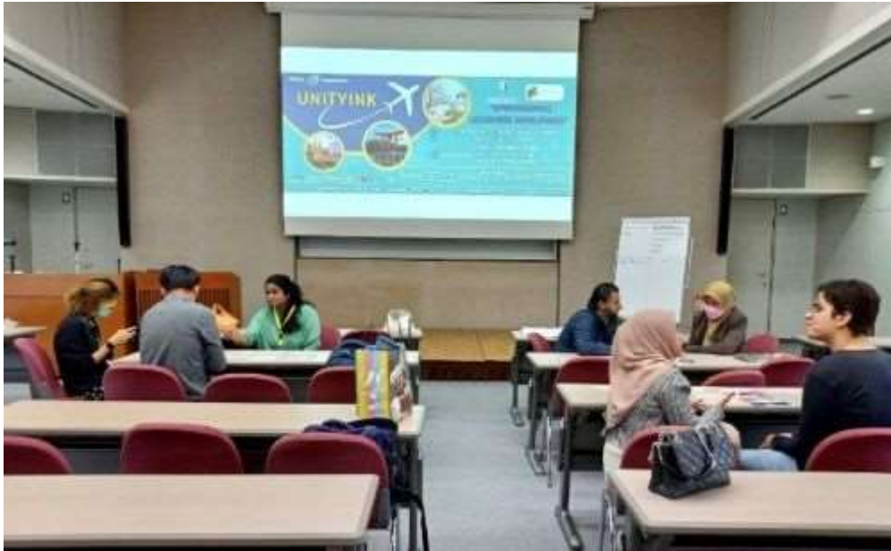
Day 1, One-to-one workshop on Abstract Writing with HU's postgraduate students