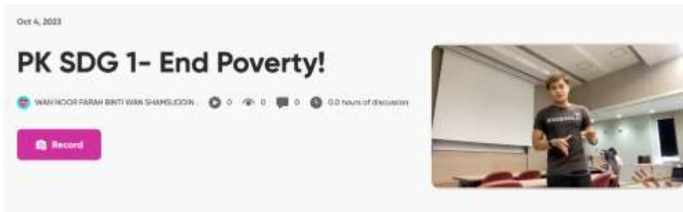
Day 2 of the workshop on presentation skills which the students have to upload their video presentations based on SDG topics