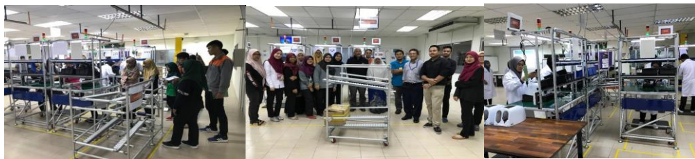
Figure 3. Activities in the learning factory

In order for them to learn from one another and receive comments from their lecturers, students were invited to explain their findings to their colleague. Assignment in the form of small group projects is given to students to help them understand and relate what they have learned during class lecture. At the same time, the students can experience using the manufacturing technology as the use the learning factory facility enables them to test and improve their level of understanding. The students were given a project at the end of the semester to develop a solution to a particular scenario that was based on actual industry problems. Figure 3 shows the activities conducted in the learning factory.