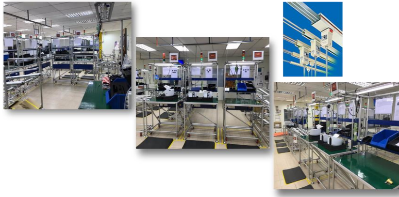
Figure 2. Facilities in the learning factory

A learning factory was first set-up at the Faculty of Industrial Management at Universiti Malaysia Pahang in 2017. Lean manufacturing was initially chosen as the subject for the pilot project. Students were taught on using and understanding lean tools based on both the theoretical classroom and hands-on activity in the learning factory. Assignments were given to the students in the form of small group projects in which they are required to come up with possible solutions using the facilities provided in the learning factory. Figure 2 presents the facilities in the learning factory.