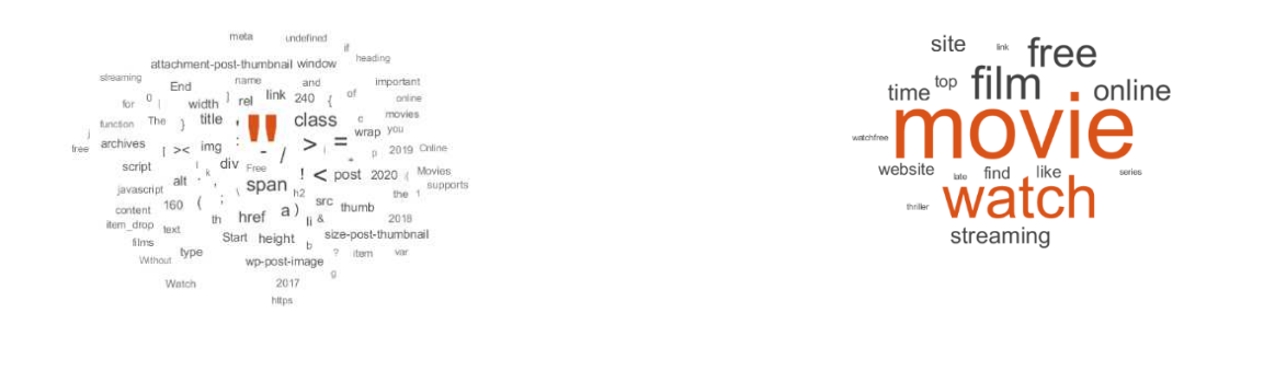
Fig. 6 Examples of word cloud images for Online Video Streaming web pages a) before web content pre-processing, and b) after web content pre-processing