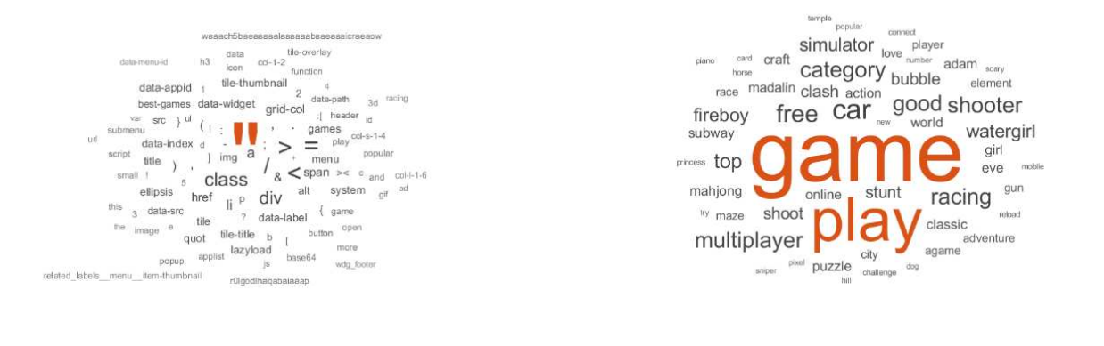
Fig. 5 Examples of word cloud images for Game web pages a) before web content pre-processing, and b) after web content pre-processing