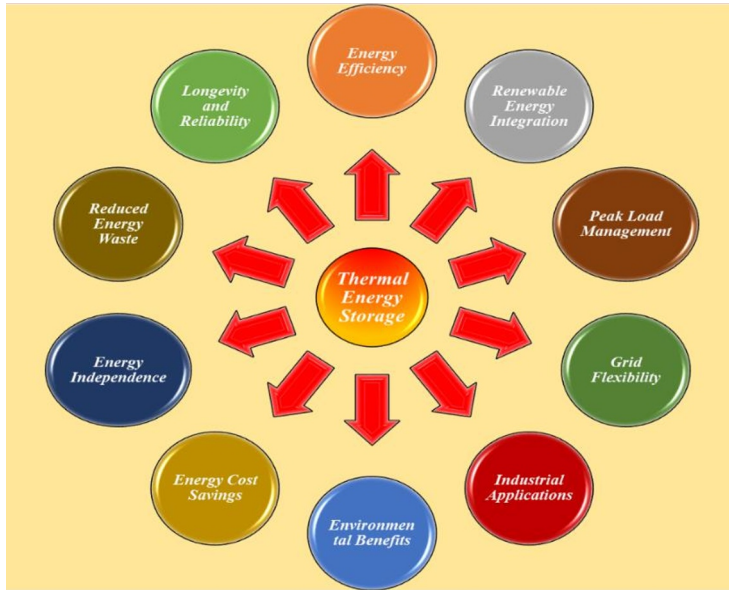
Fig. 2. Significance of Thermal Energy Storage.