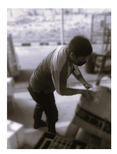
Figure 4. The worker's posture in Work Task B

Figure 4 illustrates the work posture for tiered storage and stacking (Task B), and Figure 5 provides the REBA scoring sheet analysis. According to the REBA worksheet, the neck position scores 2 points due to flexion greater than 20°. The trunk position scores 3 points for a 50° flexion, with an additional point for a slight bend, totaling 4 points. The legs' position scores 1 point, with the knees bent between 30° and 60°, adding another point for a total of 2. Additionally, the worker is handling a load exceeding 10 kg, resulting in a load/force score of 2. This score is then combined with the Group A score, which includes the neck, trunk, and legs' scores, leading to the final Score A calculation.