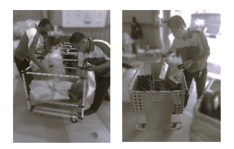
Figure 1. Work Task A - Scanning and Sorting

for subsequent distribution [6]. According to the Malaysian Occupational Safety and Health (OSH) Guideline on the Courier Service Industry, warehouse workers are recommended to utilize lifting equipment such as forklifts, reach trucks, and stackers to facilitate the handling and arrangement of packages efficiently. However, in practice, manual handling and heavy lifting by manpower are predominant for this task.