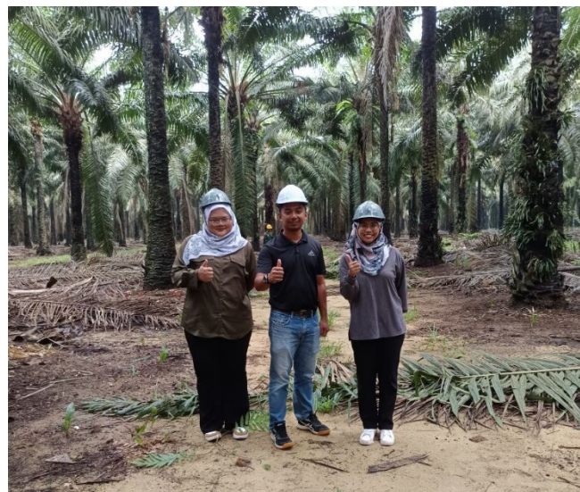
Figure 4. Visit at YPPH Palm Oil Plantation