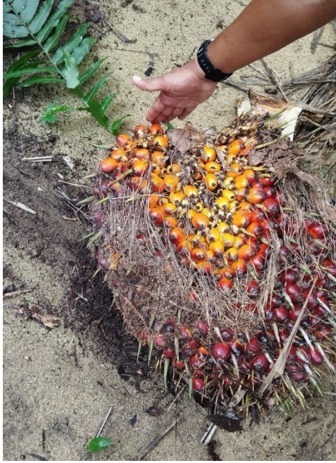
Figure 5. Ripe palm oil