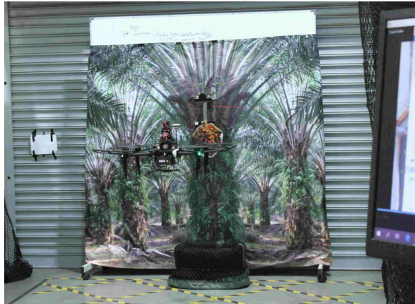
Figure 3. Kambyan AleX Laser Cutting Drone

150-watt pulsed laser that can cut through 6 inches of plant material. In its present incarnation, the model will be piloted remotely by a drone operator to trim the fronds of oil palm trees and cut through the stems of palm oil FFB. This innovative technology can be useful for harvesting FFB from tall palm oil trees. Therefore, it is recommended for YPPH to collaborate with Kambyan Network to launch their laser cutting drone in the YPPH plantation.