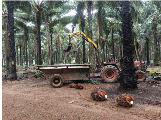
Figure 6. In-field collection stage during harvesting