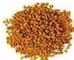
Figure 1.1 : HALBA seeds

Fenugreek consists of the dried ripe seeds of a small, southern European herb known technically as Trigonella foenum-graecum L., a member of the family Fabaceae. It is variously referred to as trigonella or as Greek hayseed. The seeds contain up to 40 percent of mucilage causing them to be used in various poultices and ointments intended for external application. The name fenugreek or foenum-graecum is from Latin for "Greek hay". Zohary and Hopf note that it is not yet certain which wild strain of the genus Trigonella gave rise to the domesticated fenugreek but believe it was brought into cultivation in the Near East. Charred fenugreek seeds have been recovered from Tell Halal, Iraq, (radiocarbon dating to 4000 BC) and Bronze Age levels of Lachish, as well as desiccated seeds from the tomb of Tutankhamen. Cato the Elder lists fenugreek with clover and vetch as crops grown to feed cattle. [1]