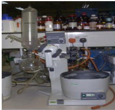
Figure 2.5 Rotary evaporator

The system works because lowering the pressure lowers the boiling point of liquids and thus the solvent. This allows the solvent to be removed without excessive. Figure 2.5 showed the picture of rotary evaporator.