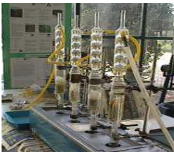
Figure 2.3 Soxhlet extractor

In the soxhlet extractor, there are five main components. The components are condenser, extraction chamber, thimble, siphon arm and round boiling flask. Figure 2.3 and figure 2.4. showed the picture and schematic of soxhlet extractor.