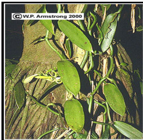
Figure 2.1 Vanilla plant

Cortez brought vanilla back to Europe in the sixteenth century, after having observed Montezuma drinking the cocoa concoction. It has many non-culinary uses, including aromatizing perfumes, cigars and liqueurs. Europeans prefer to use the bean, while North Americans usually use the extract. Substances called “vanilla flavour” don’t contain vanilla at all, being synthesized from eugenol (clove oil), waste paper pulp, coal tar or ‘coumarin’, found in the tonka bean, whose use is forbidden in several countries. Ice cream producers are unlikely to point out that their most popular flavour derives its name from the Latin word vagina.