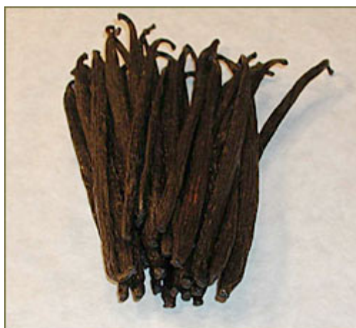
Figure 2.2 Vanilla beans after pre treatment process

The pods take about nine months to mature and are harvested when the tips begin to turn from yellow. Until recently, the curing process was long and complicated. The beans are first wrapped and subjected to high temperature and humidity to 'kill' the vegetative life. The next process involves alternate drying in the sun by day and sweating by night for several days. At this point the beans are dark, oily and pliable and are then slowly dried in the shade for up to two months. They are then sorted and graded and placed in chests for a further conditioning period of one or two months. Figure 2.2 shows the picture of vanilla beans after a pre treatment process.