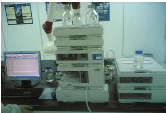
Figure 2.6 High Performance Liquid Chromatography