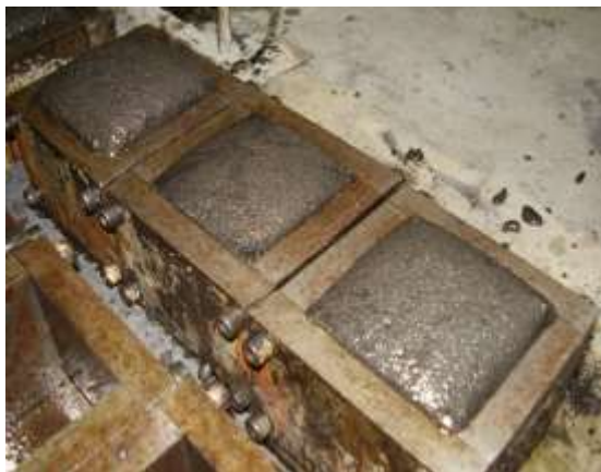
Fig. 3: Expanded aerated concrete before trimming

Specimens to be tested for compressive strength were subjected to water curing until testing age. Compressive strength test was conducted in accordance to BS EN 12390 – 3 [11] at the age of 7, 28 and 90 days. Specimens to be used for sulphate resistance test were prepared in form of mortar bars (25 x 25 x 250mm). After water cured for 28 days, the specimens were immersed in 10% Sodium Sulphate solution for duration of 9 weeks. The elongation of mortar bars were measured every week following the procedures outlined in ASTM C1012 - 13 [12].