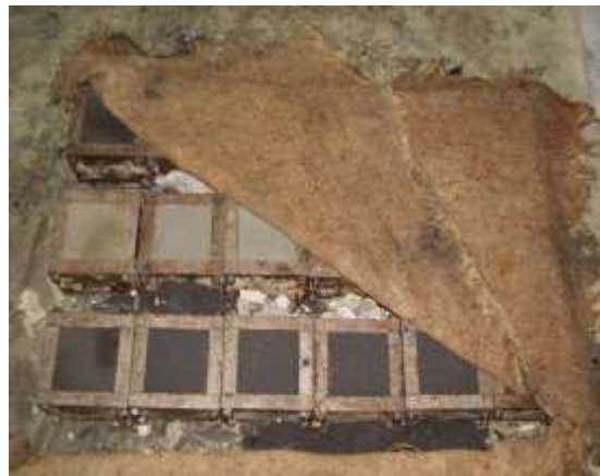
Fig. 4: Aerated concrete covered with gunny sack