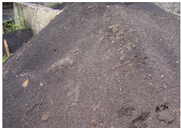
Fig. 2: Palm oil fuel ash dumped as waste