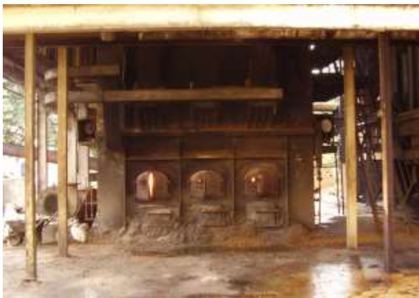
Fig. 1: Incinerator producing palm oil fuel ash

A single batch of ordinary Portland cement (OPC) was used as binder throughout the experiments. The sand used was initially oven dried for 24 hours before sieved passing 300µm sieve. Potable water was used for concrete preparation and curing purpose. Aluminium powder was used to produce air voids inside the concrete to make it lower density. Palm oil fuel ash used as partial sand replacement in this research was collected from a local palm oil mill located in Bukit Lawang, Johor. The ash collected is the end product of pressed palm oil fiber and shell which burned in the incinerator shown in Fig. 1. It is then disposed in the vicinity of the mill as illustrated in Fig. 2. The collected ashes were sieved passing 300µm before oven dried for 24 hours. After that, modified Los Angeles Abrasion Machine was used to grind the coarse ash to be finer particle and ready to be used for aerated concrete preparation. Based on the chemical composition of palm oil fuel ash tabulated in Table 1, this pozzolanic ash is categorised as Class F in accordance to ASTM C618-12 [10].