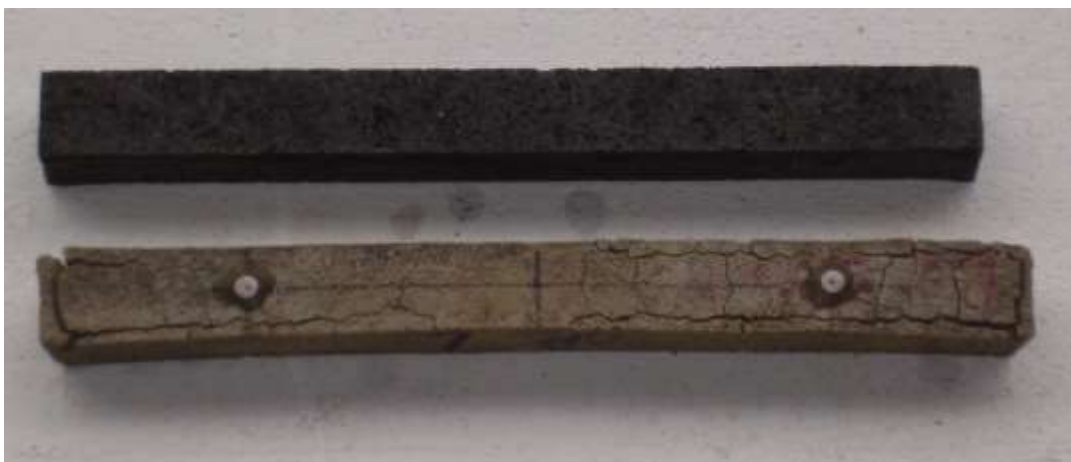
Fig. 7: Evident cracks and elongation of plain aerated concrete mortar bar (greyish specimen) in contrast to mortar bar containing palm oil fuel ash (black specimen)