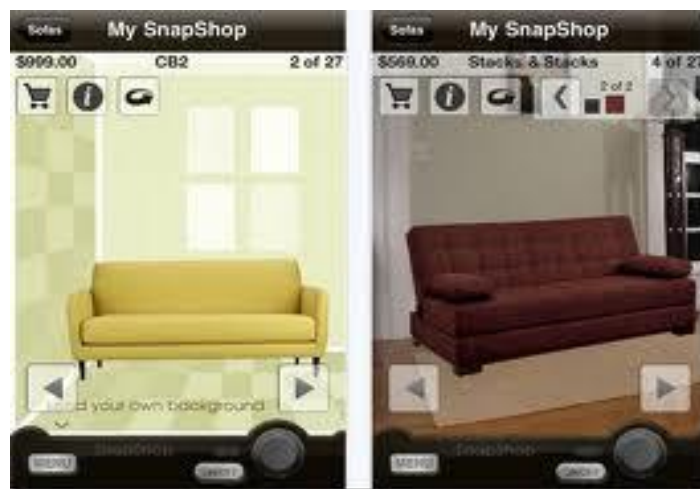
Figure 1.6: Design of a virtual chair by using SnapShop Showroom

SnapShop Showroom is a tool that helps user to visualize different furniture in the house before purchase the real item. SnapShop Showroom is a free augmented reality application that everyone can easy download it. There are few simple several steps to use this application. First, select a sofa from the libraries provided in the application, and then the sofa's image will be overlaid on the room. Users can move the sofa around in order to fit to the room and change the colours of the sofas. The image can be saving by using this application.