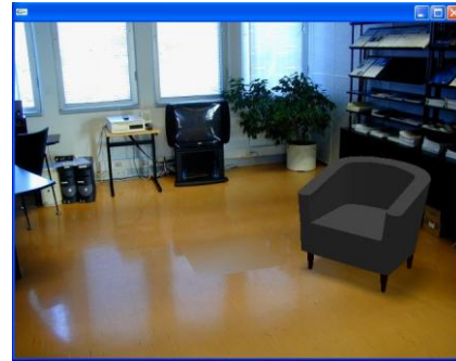
Figure 1.2: Object moved and rotated to a place (left) and Figure1.3: Marker erased and shadows added (right)

The other research paper, Tiina and Sanni (2012) describe a process of the collaborative design and fulfilment request of an interactive interior design service system. The technological purpose was to create interior design concepts that utilize augmented reality (AR), 3D models and user-generated content within the system framework. They come out with the important AR features of the interior design service such as realistic lighting, and number of variety furniture models available. By using the AR technology, it is important to let user visualise a lighting that are more real for the whole day weather based on the location of the windows. This can provide user more realistic light when use the system. With the 3D representation of interior design, user also can't view a better graphics of visualization. For example, User can view the design of the table, chair, cabinet and etc more effectively. Finally, it was important to let user or designer to sense that decorate the rooms and establish a plan was interesting and pleasure when using the interactive interior design service system.