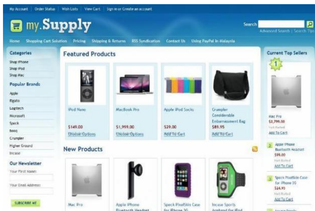
Figure 1.9: Design of E-Commerce Website

E-Commerce is the web services that provide online shopping. Nowadays, many people do online shopping through E-Commerce. This is because there are many choices of products have been provided in this website. By browse the website, user can gather information about products and prices. This make E-Commerce become a favourite place that people like to browse for the product.