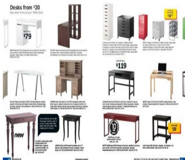
Figure 1.7: Design of IKEA Catalog