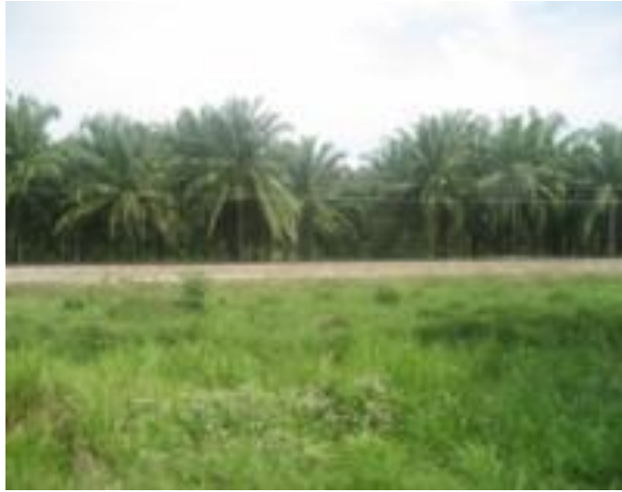
Figure 2.1: Planting

Oil palm was introduced to Java by the Dutch in 1848 and to Malaysia in 1910 by Scotsman William Sime and English banker Henry Darby. The first plantations were mostly established and operated by British plantation owners, such as Sime Darby and Boustead.