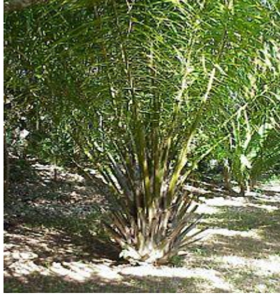
Figure 2.2: African Oil Palm ( Elaeis guineensis )