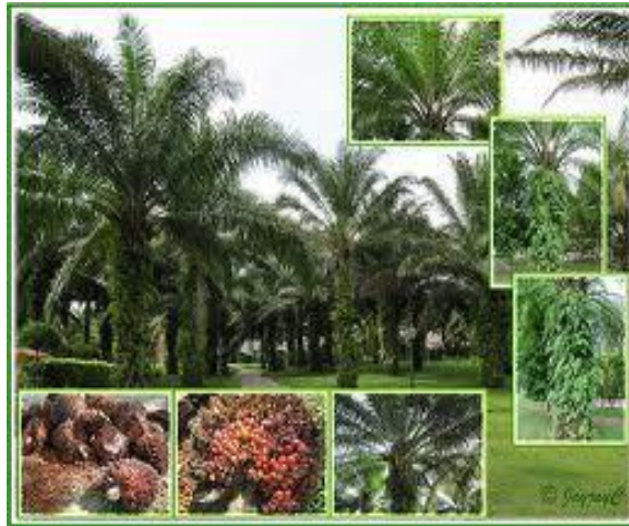
Figure 2.4: Tropical Palm Trees

The palm fruit takes five to six months to mature from pollination to maturity. The palm fruit is reddish, about the size of a large plum and grows in large bunches. Each fruit is made up of an oily, fleshy outer layer known as the pericarp, with a single seed or the palm kernel, also rich in oil.