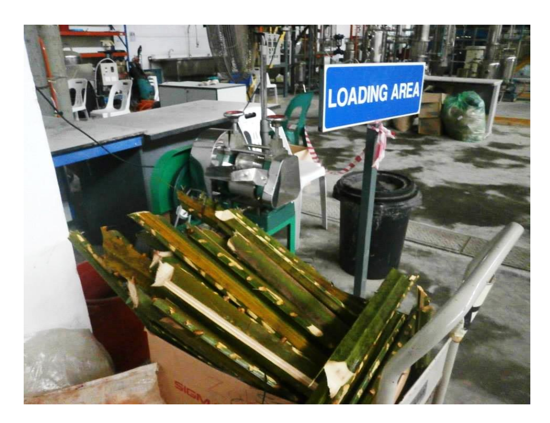
Figure 2-3: Oil palm fronds, without leaves

Oil palm fronds (OPF) are lignocellulolytic biomass that is an inexpensive raw material containing 40 to 60 percent cellulose, 20 to 40 percent hemicellulose and 15 to 30 percent lignin. In the plantations, OPFs are available throughout the year as they are regularly cut during harvesting of fresh fruit bunches (FFBs) and pruning of the palm trees. The availability of fronds during the pruning activity was calculated using an estimate of 10.4 tonnes ha<sup>-1</sup>, which currently gives an average of 6.97 million tonnes per year. Meanwhile, it was estimated at an average of 54.43 million tonnes per year of oil palm fronds will be available during the replanting process in the years of 2007 - 2020. Additional fronds as well as oil palm trunks (OPT) become available in the plantations during the replanting of oil palm trees every 25 to 30 years. The OPF is obtained during pruning to harvest the fresh fruit bunch (FFB), therefore it is available daily. OPF is currently under-utilized as the plantation owners believe that all the OPF is necessary for nutrient recycling and soil conservation (Hassan et al., 1994; Wan Zahari et al., 2002). Hence, pruned fronds are just left on the plantation. However, our study shows that OPF does not contain high metal contents as widely thought, but contain high levels of carbohydrates in the form of simple sugars. Therefore, part of the OPF can be utilized for other purpose without scarifying the nutrient recycling process.